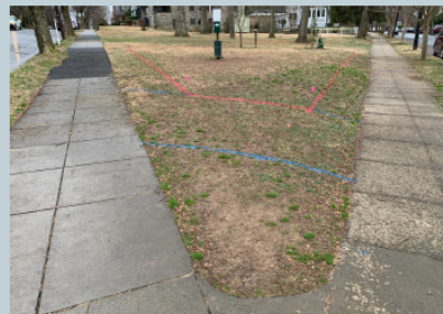
The intersection of 18 th and Argyle show the extents of the bike parking (Blue) and the play spot (Pink)

MONDAY OCTOBER 16, 2023 CRESTWOOD TRIANGLE PARK WILL BE CLOSED FOR RENOVATIONS.